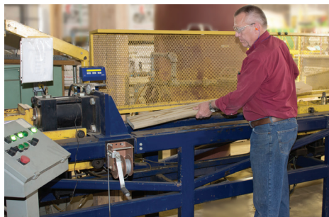
Titan Timbers are tested daily to meet AITC standards.